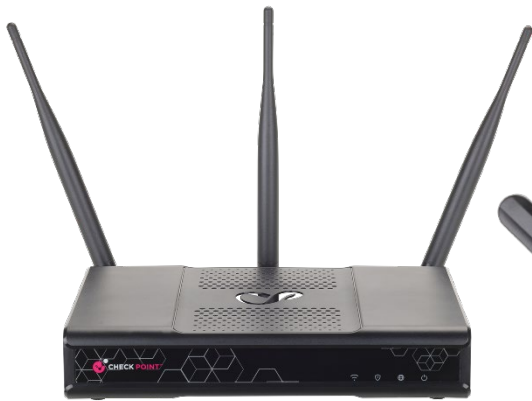
1535 and 1555 Pro Wi-Fi