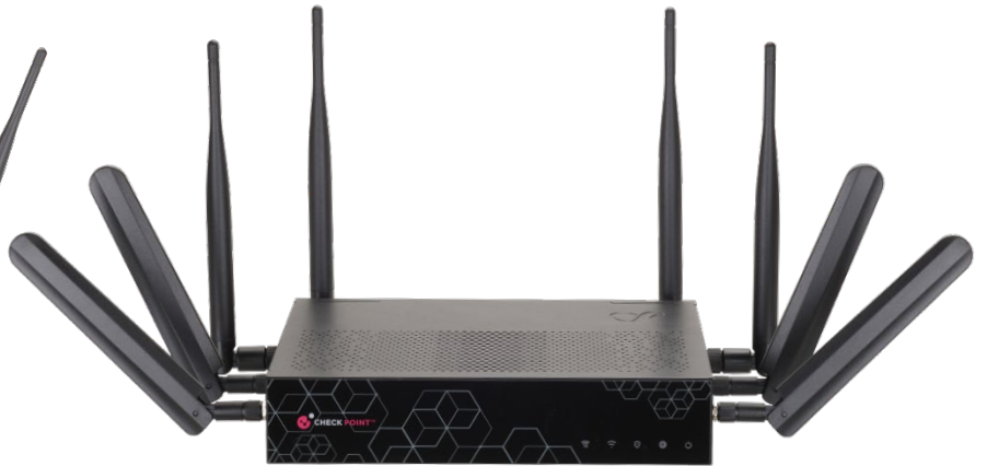
1595 Pro Wi-Fi 5G

Named Leader by Top Analyst Firms: Gartner® Firewall Magic Quadrant™ Forrester Wave™: Enterprise Firewalls 2022